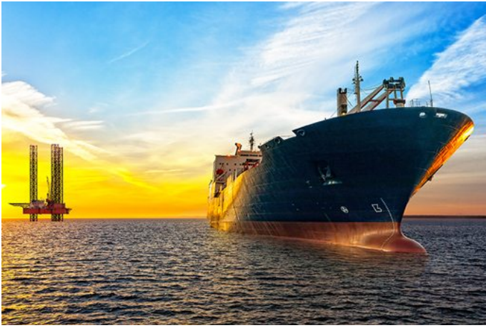
Maritime & Admiralty