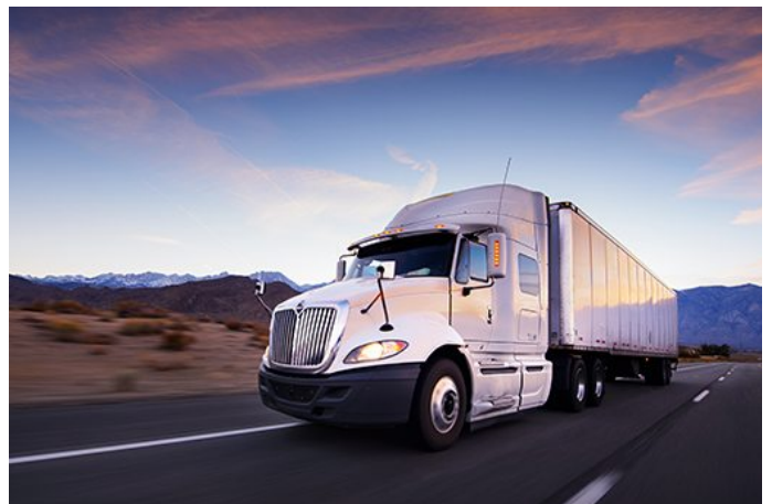
Trucking & Transportation