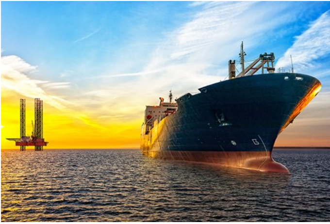
Maritime & Admiralty