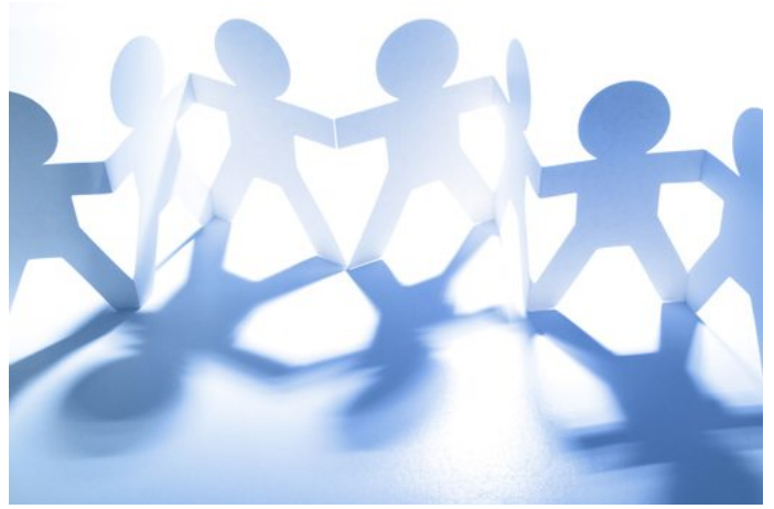
Mass Tort & Class Action