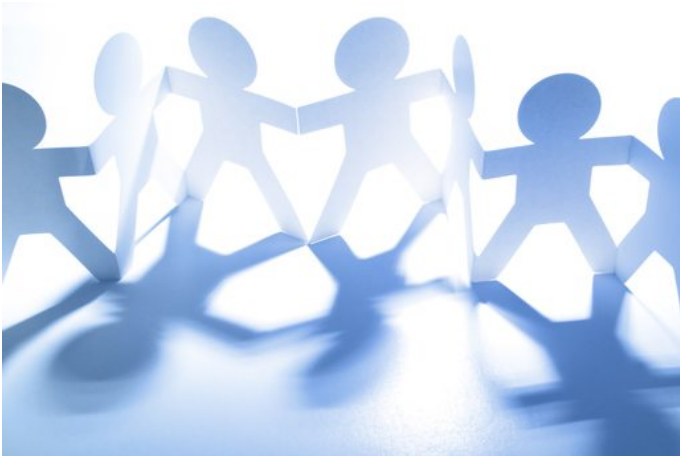
Mass Tort & Class Action