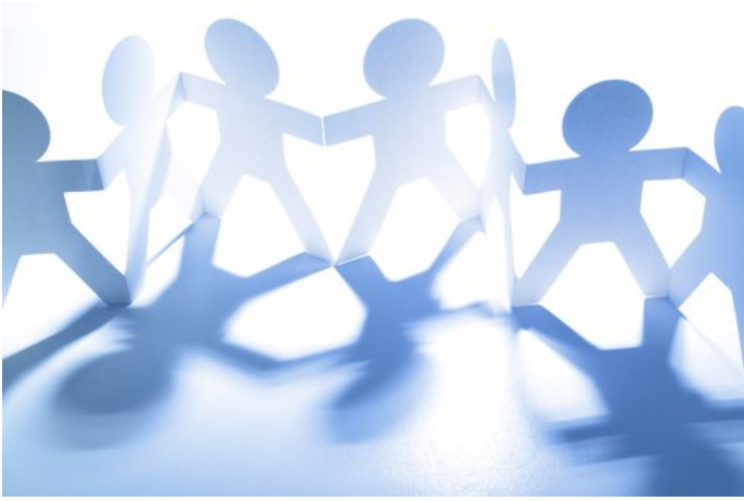
Mass Tort & Class Action