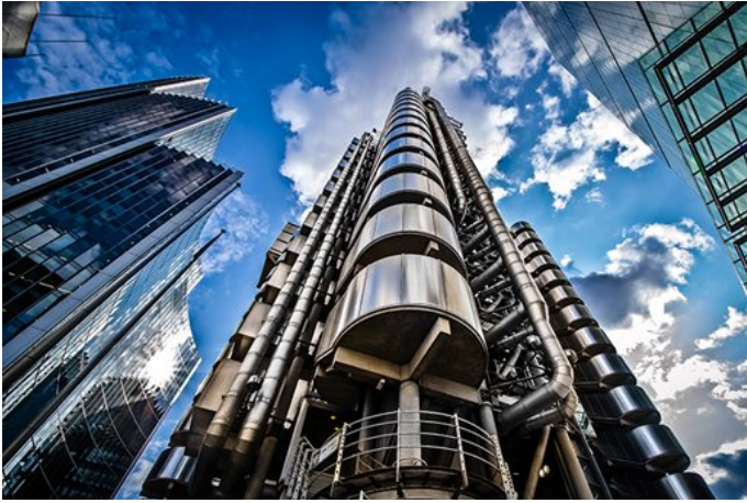
Insurance Defense & Coverage