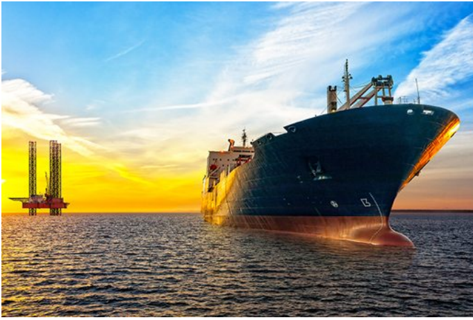
Maritime & Admiralty